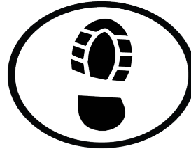
Anti - Slip / Dual Density