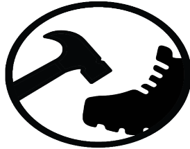
Steel / Composite Toe Cap