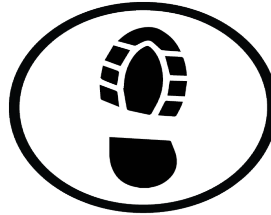
Anti - Slip / Dual Density